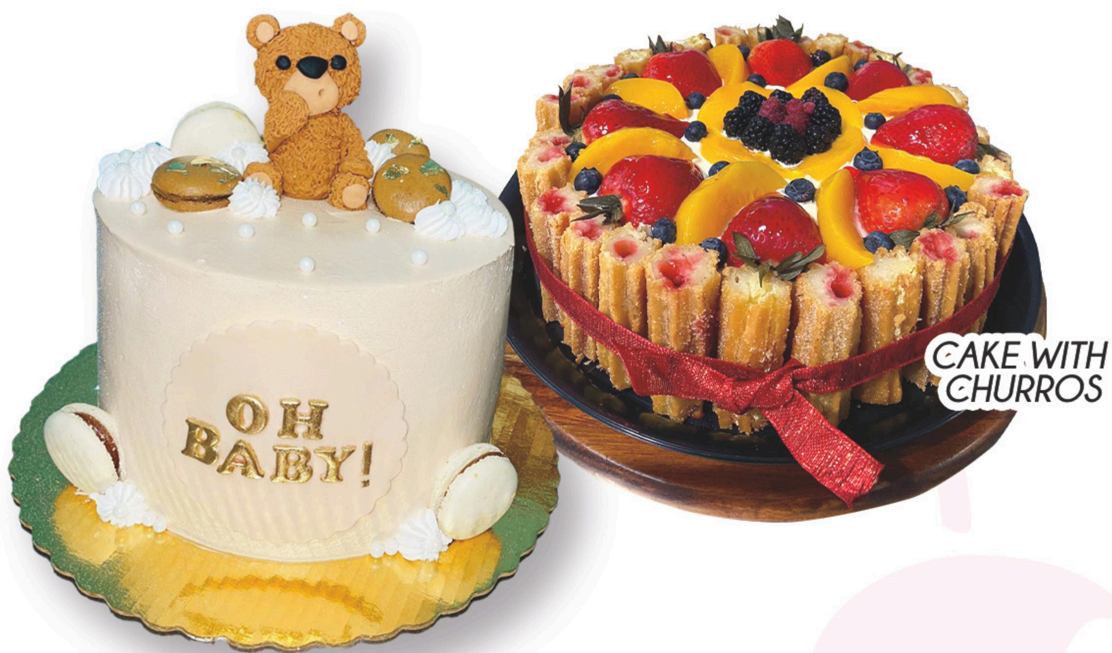
CAKE WITH CHURROS